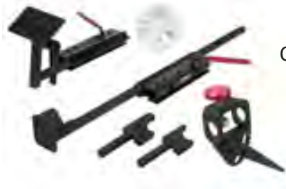
Oneway Wolverine Grinding Jig

Quick look On-line pricing range $92 to $103