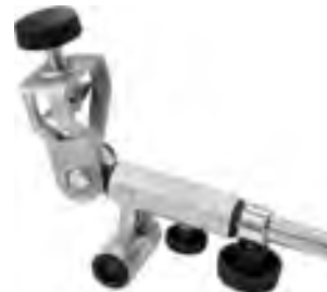
SVD-186R Gouge Jig