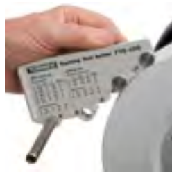
TTS-100 Turning Tool Setter