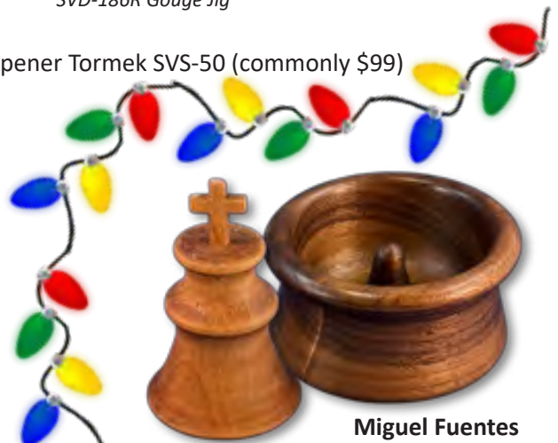
Miguel Fuentes Mimosa / Walnut