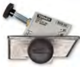
Straight or Curved End Sharpener SVS-50