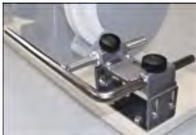
BGM-100 Mounting Set