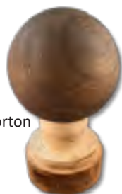
Kent Horton Walnut