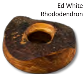
Ed White Rhododendron