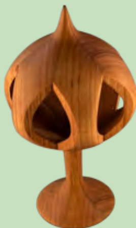
Ethan Green - Cherry