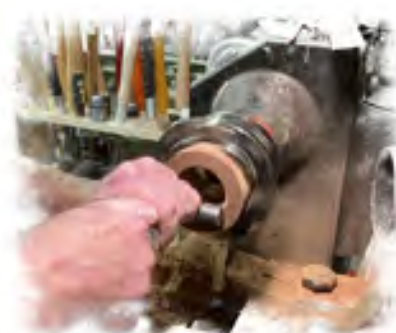
Thread Chasing Tool