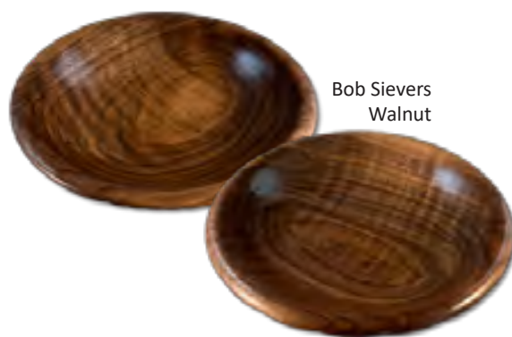
Bob Sievers Walnut

We could use a couple of extra hands with our AV/Zoom with Ramon Lyn. Set up and take down takes a lot of time for one person causing us to start a little late each month and getting out of the building after our meetings. Ramon is happy to train you on set up and take down to store our cameras and equipment. Having an extra boom operator when Ken Huff is not available is helpful.