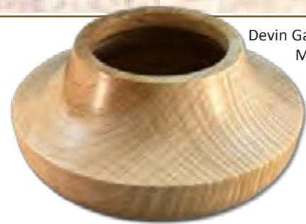
Devin Garlick Maple