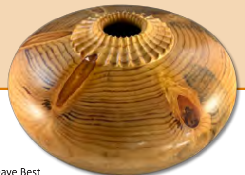
Dave Best Monkey Puzzle