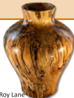
Roy Lane Birch