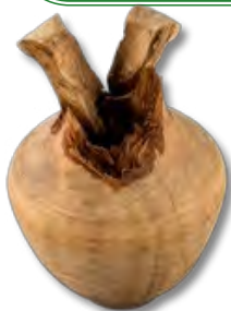
Ed White Hazelnut

See page 11 for store product list with prices.