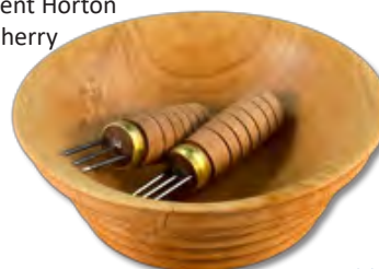
Kent Horton Cherry