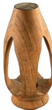
Chuck Burke Black Walnut