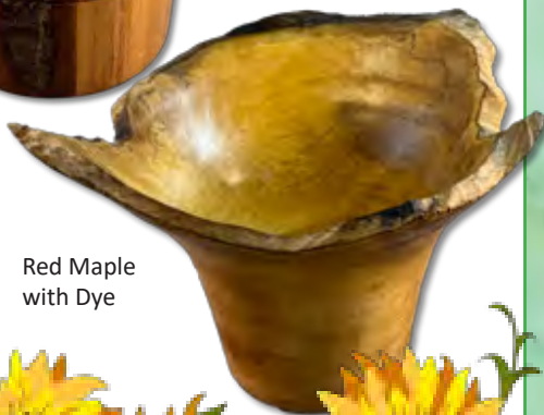
Red Maple with Dye