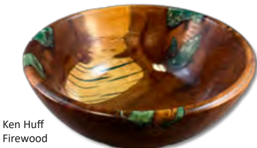
Ken Huff Firewood