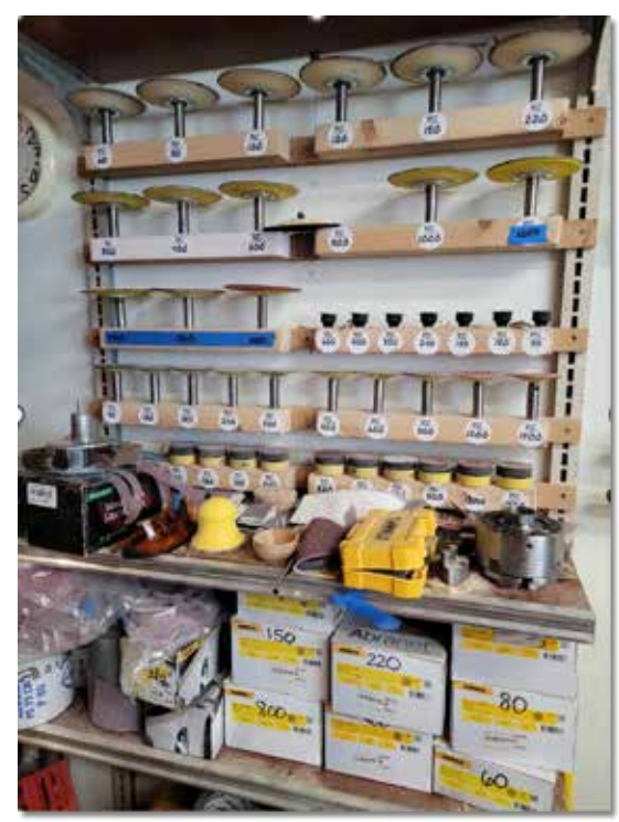
This is the Sanding Wall in my garage, adjacent to my lathe and toolbox.

I am constantly working on improving my finishing process. If you visited my shop on the shop tour last year, you saw my sanding wall and my lathe setup. Let me know if you are interested in seeing it in person.