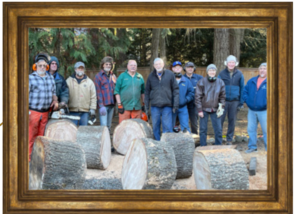
Our beloved WoodRats hard at work harvesting a Garry Oak for this year's Holiday Party.