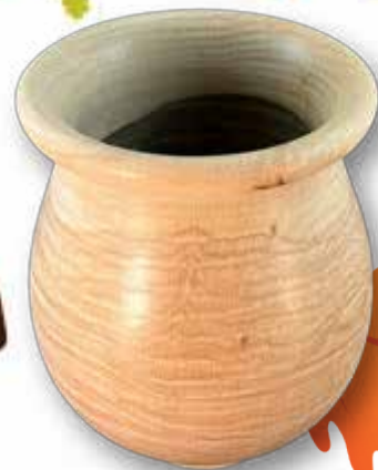
Ed White White Oak