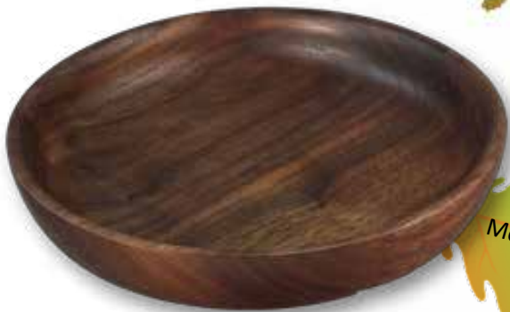
Monte Windsor Walnut