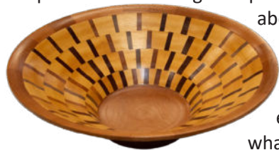
Segmented Bowl Unknown Turner