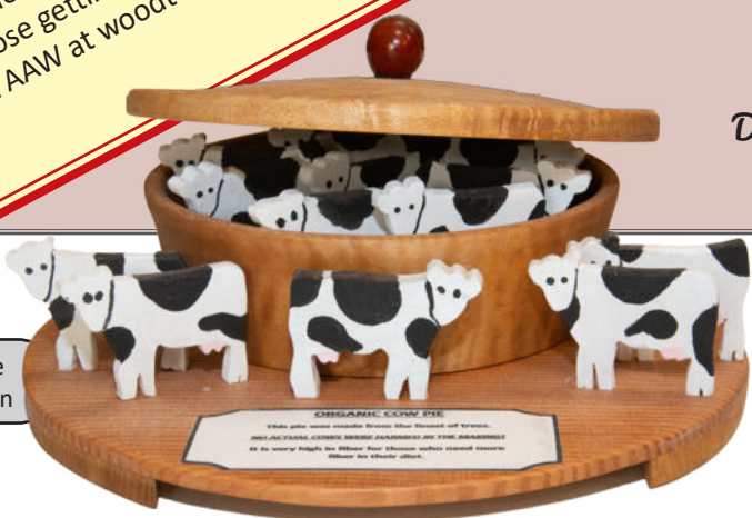
ORGANIC COW PIE When you have made these, they should all have... ...the same shape as those that I have shown... ...in the video. If you have any questions, please contact me... ...about the video above.