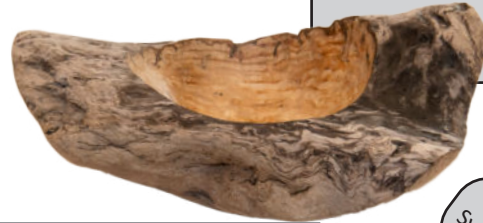
Driftwood - Alderwood Live Edge Bowl Don Mars

X Note: In house demos will be broadcast on Zoom from the Fife Center. DO NOT MISS OUT! Read the instructions on the next page.