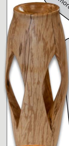
Inside Out Sycamore Vase