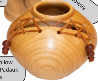
Cherry Hollow Form With Padauk Beads