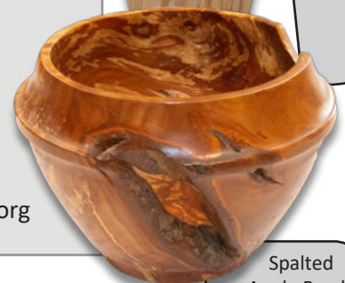
Spalted Apple Bowl