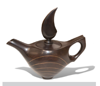
Work from the SPSW photo archives

Windfall : Due to current restrictions and falling membership, a sister organization in the area, the Evergreen Wood Workers Guild (EWWG) has chosen to disband. Like we are, they are a 501.c.3., and rules require that the assets of such an organization be transferred to another 501.c.3 organization. EWWG's board chose to donate slightly under eight thousand dollars to the SPSW! On the one hand, I am happy to report this cash infusion into the SPSW coffers. But, on the other hand, I will miss all the great people and all the wonderful programs that the EWWG was offering to the area's wood working community!