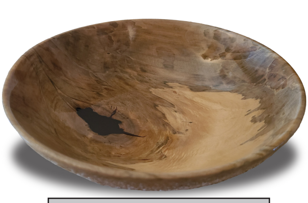
Sugar Maple Bowl - Bob Stafford