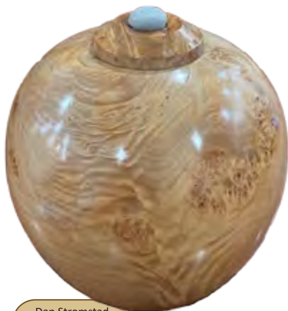
Dan Stromstad Big Leaf Maple