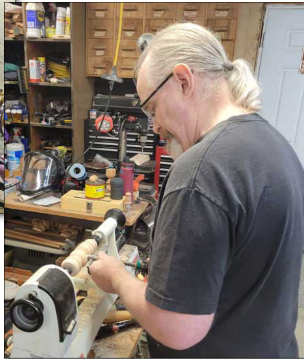
Some spindle practice at the September Sawdust Session