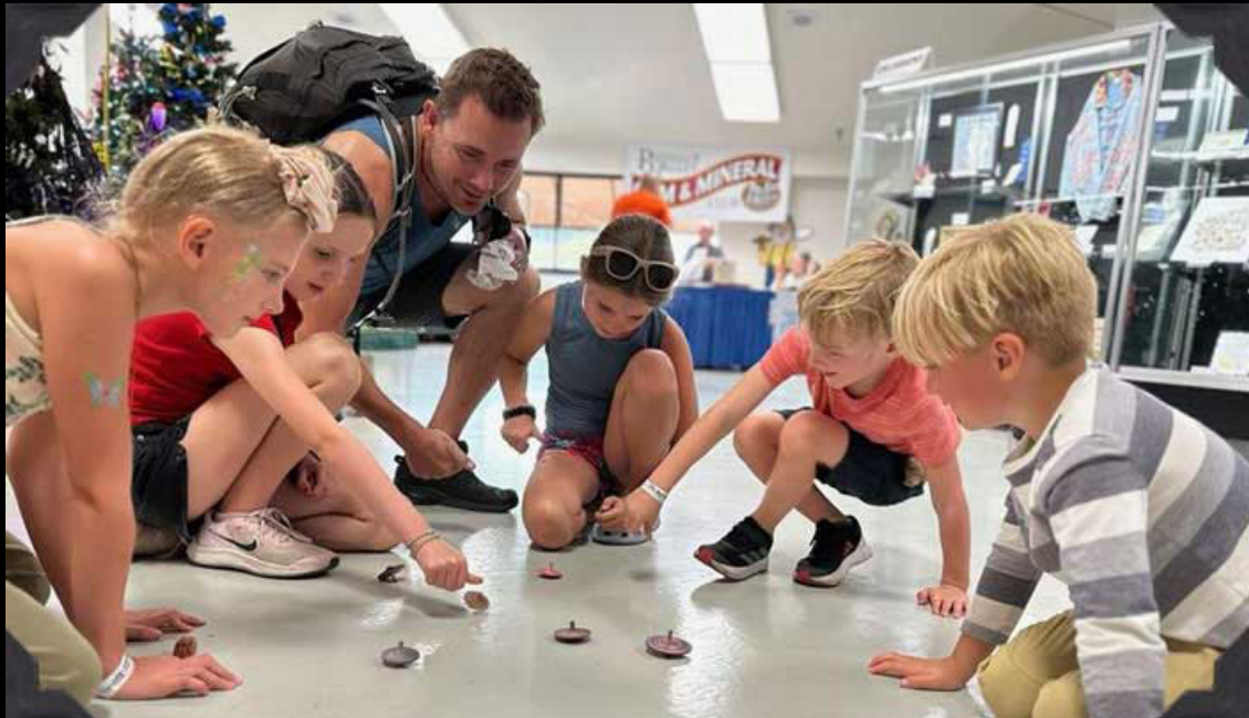
Kids (?) Enjoying the Tops Turned by SPSW