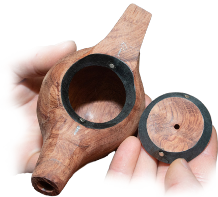
Work from the SPSW photo archives