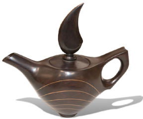
Work from the SPSW photo archives

Windfall: Due to current restrictions and falling membership, a sister organization in the area, the Evergreen Wood Workers Guild (EWWG) has chosen to disband. Like we are, they are a 501.c.3. , and rules require that the assets of such an organization be transferred to another 501.c.3 organization. EWWG's board chose to donate slightly under eight thousand dollars to the SPSW! On the one hand, I am happy to report this cash infusion into the SPSW coffers. But, on the other hand, I will miss all the great people and all the wonderful programs that the EWWG was offering to the area's wood working community!