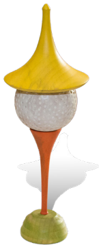
Work from the SPSW photo archives

Club Activities that continue despite current restrictions: Group meeting limits imposed during the pandemic have affected our ability to meet in person, and made many of the benefits we have traditionally offered to members much more difficult until we are able to meet in person again. But there are three things we are still able to provide. One is that Michael Poirier continues to offer mentoring up in the Lake Morton/Covington area. Second, Doug Reynolds offers wood cutting parties, when we have downed trees donated to the club. This is a great source of what is usually green wood for members to turn. Lastly, through Zoom, we have also been able to offer world-class demonstrators during our regular meeting time on the third Thursday of the month. If you are not joining us for these remote demos, you are really missing out! You helped fund them when you paid your dues. There is no extra charge for access to instruction from some of the finest woodturners in the world! We would like to see more of our members taking advantage of this wonderful resource! Please join us. If you haven't used Zoom to join a similar event before, just follow the directions at the end of this newsletter.