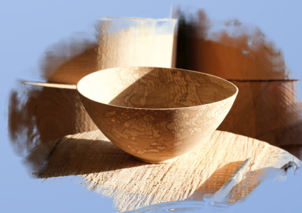
Thin Walled Bowl - Glen Lucas