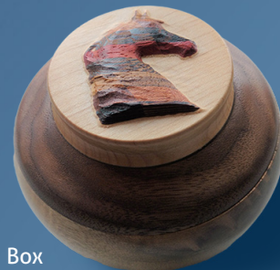
Lidded Box Alan Winslow